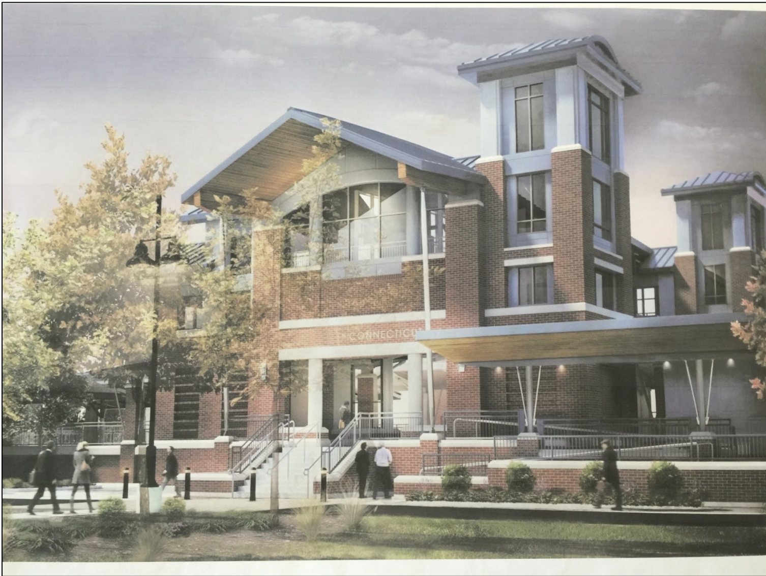
North Haven Train Station